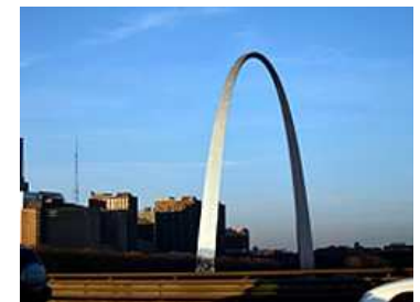
St. Louis Clean Cities