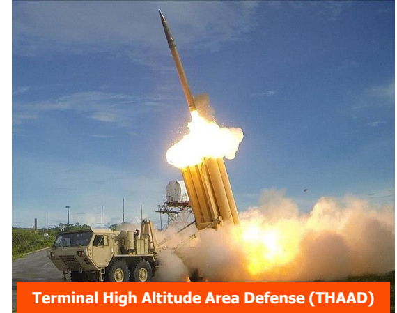
Terminal High Altitude Area Defense (THAAD)