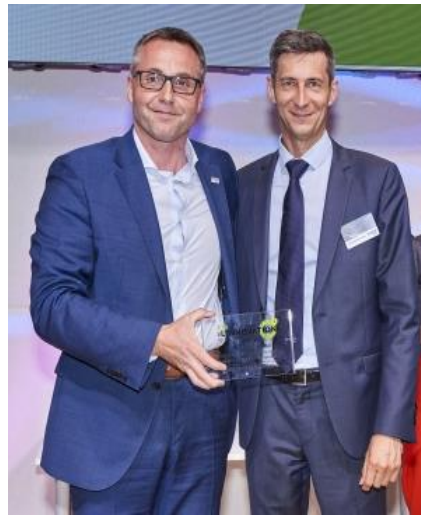
2018 Public Transport Innovation Award "Move Green" Category