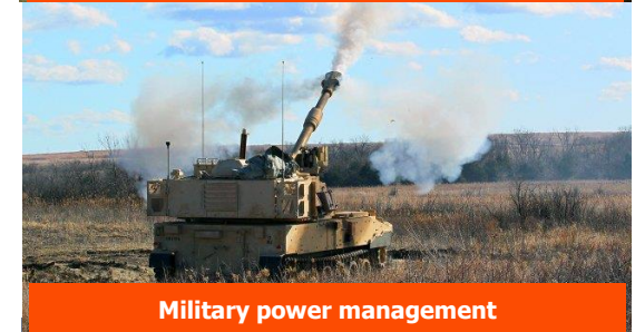
Military power management