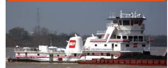
Commercial power & propulsion